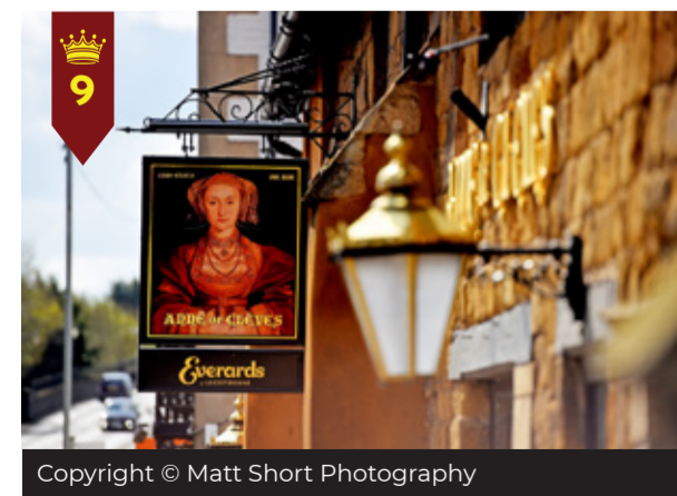
ANNE OF CLEVES