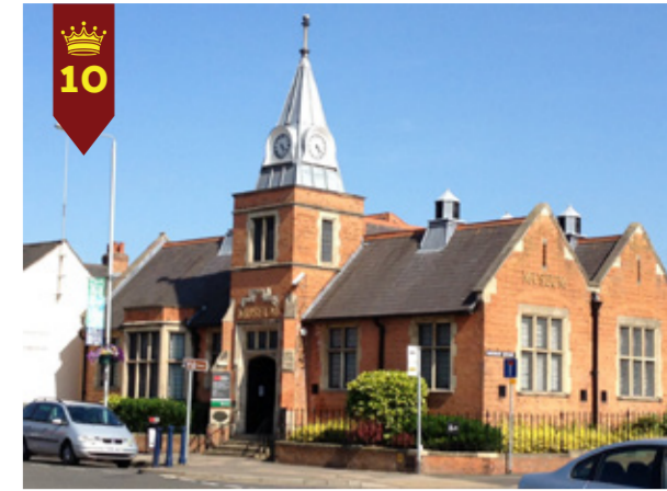
MELTON CARNEGIE MUSEUM