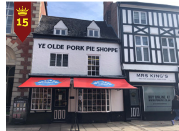
YE OLDE PORK PIE SHOPPE