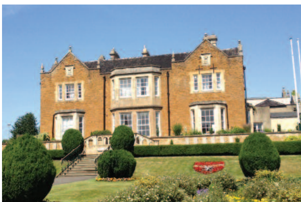
1. EGERTON LODGE