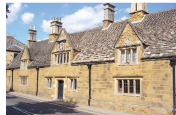
7. BEDE HOUSE