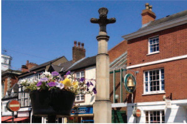
2. CORN CROSS