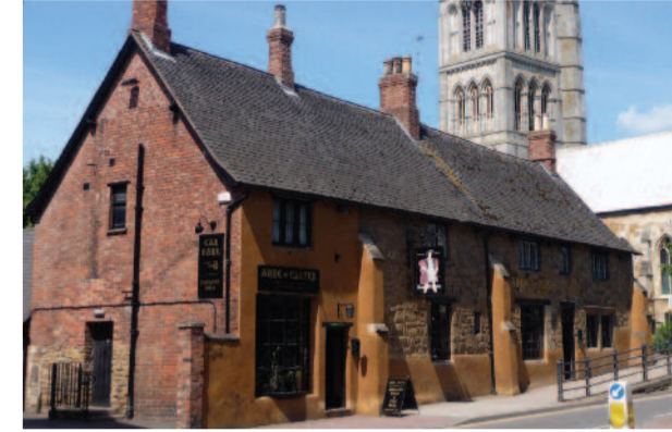
8. ANNE OF CLEVES