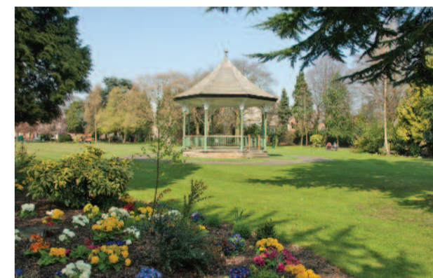
10. PLAY CLOSE