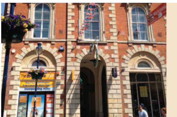
4. CORN EXCHANGE