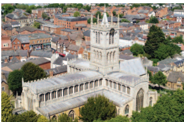
5. ST. MARY'S CHURCH