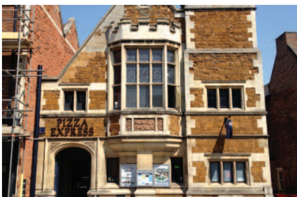
6. COLLES HALL