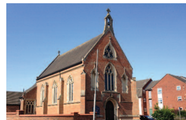
11. ST. JOHN THE BAPTIST CHURCH