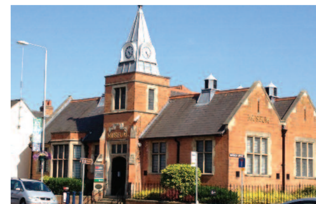
12. MELTON CARNEGIE MUSEUM