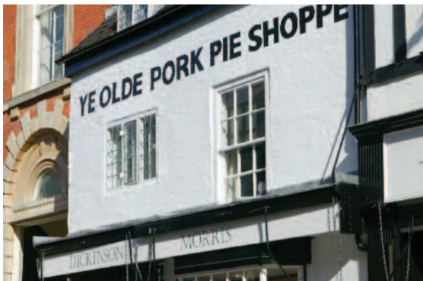
3. YE OLDE PORK PIE SHOPPE