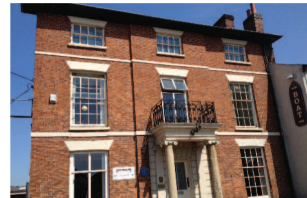
9. CARDIGAN HOUSE